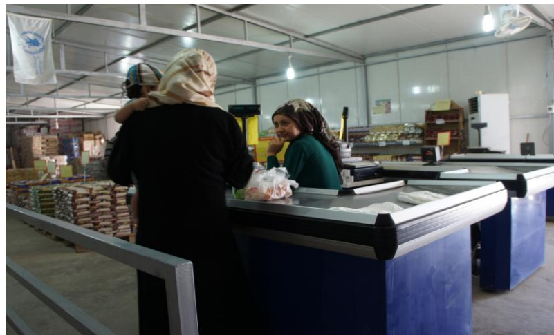
Syrian woman shopping in the market in Nizip 1 camp, Gaziantep - WFP, 2014

WFP has contracted six new shops in urban centres to provide a wider variety of markets, goods and prices to beneficiaries. WFP monitoring findings show decreased prices and other positive gains in areas where additional shops have been contracted.