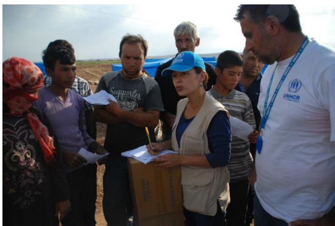
UNHCR delivery of CRIs to families living in make-shift shelters in fields next to Kizilhoyuk village Suruc.

UNHCR hosted an Inter-Agency meeting in Gaziantep on 01 October. During the meeting UNHCR gave a detailed gap analysis presentation with inputs from needs analyses conducted by INGOs IMC, CARE, DRC, IRC, and Turkish NGOs IMPR and Support to Life. These assessments covered 10 official and non-official shelters and the needs identified per sector were discussed in the meeting.