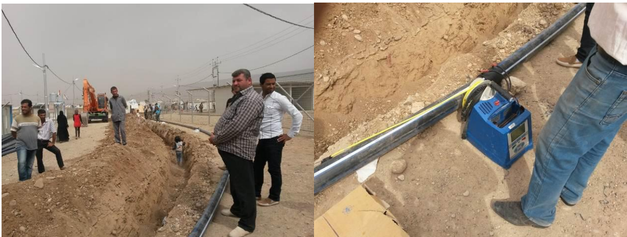
ACF Temporary Water Network Establishment, Basirma camp.