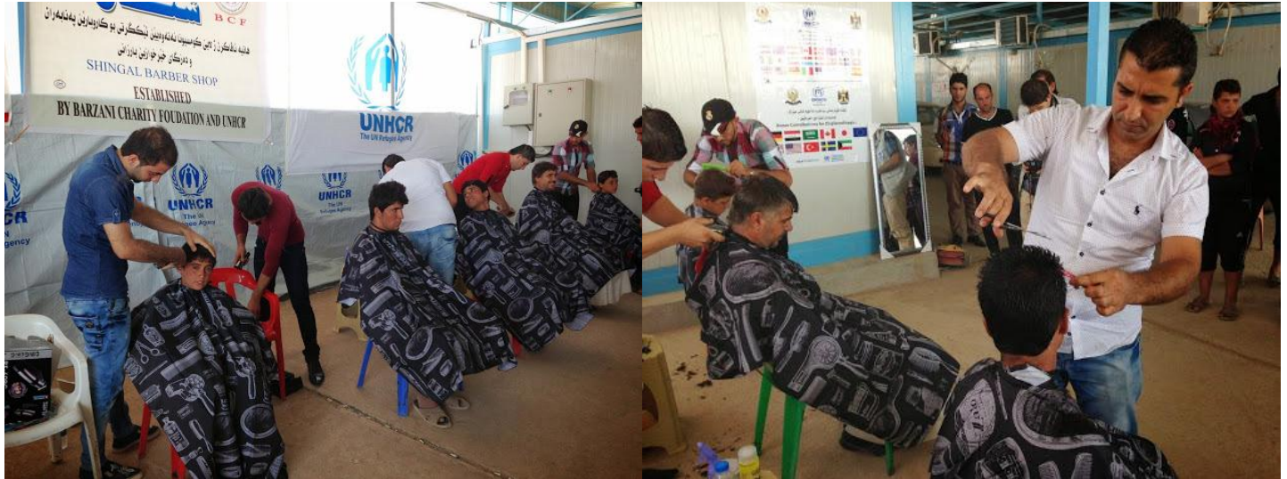
Refugee barbers from Domiz camp volunteer their skills at Bajet Kandala IDP camp.

They set up an impromptu barber shop at Bajet Kandala, and the lines of those awaiting a trim were long.