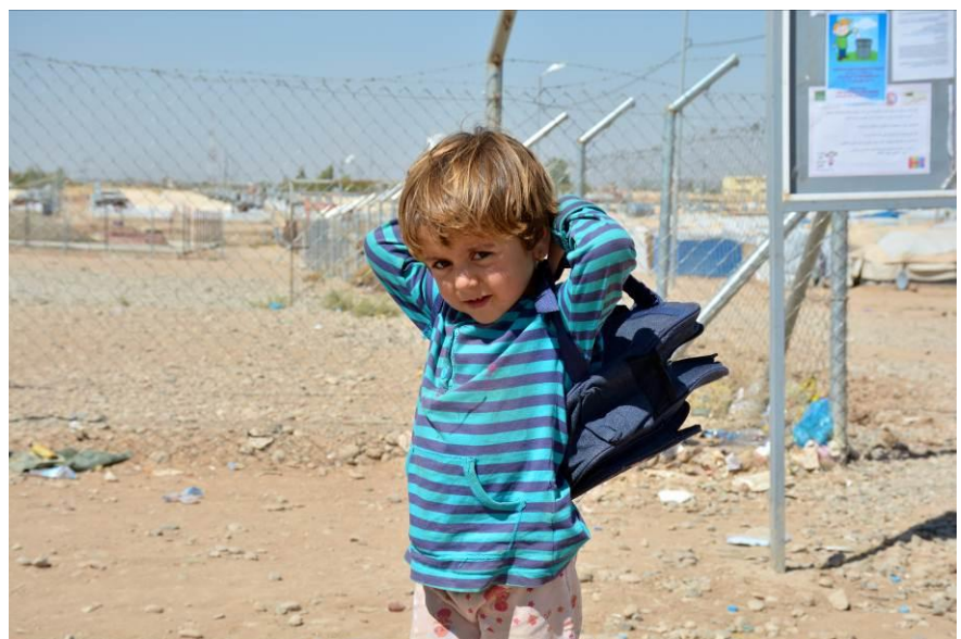
A Syrian boy leaves his classroom in Qushtapa refugee camp, Erbil.