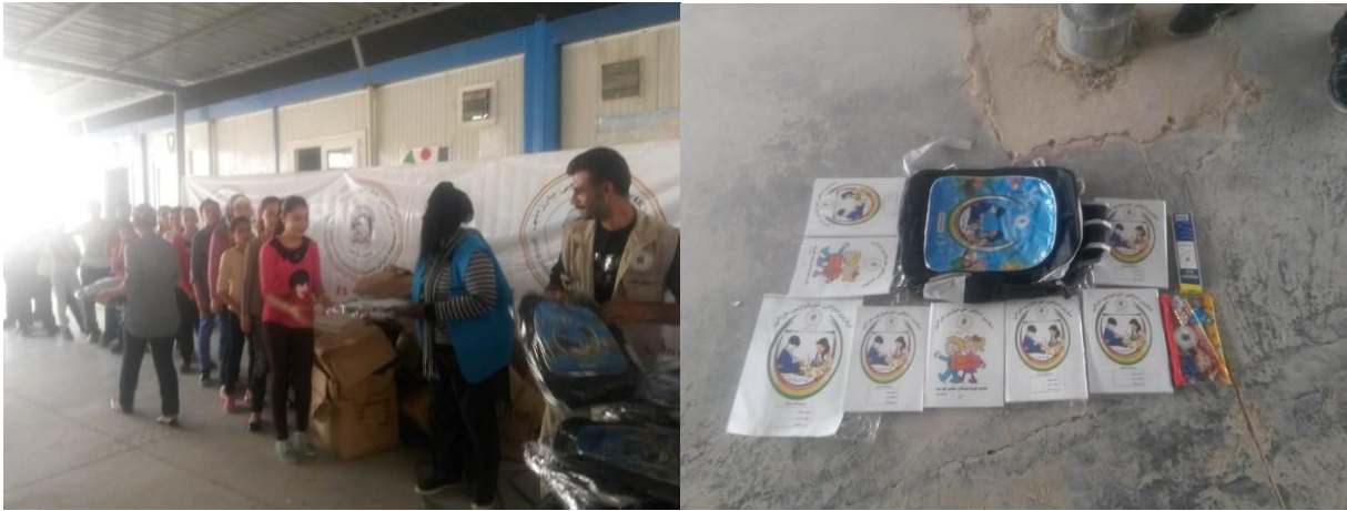
School Bags Distribution by Barzani Charity Foundation at Basirma camp.