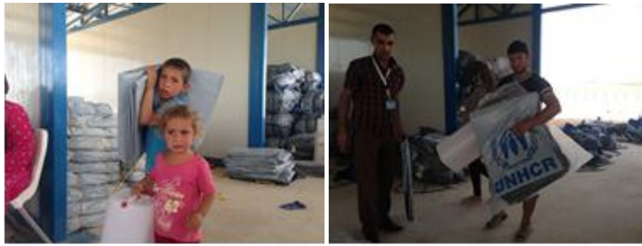
Distribution of winterization items.