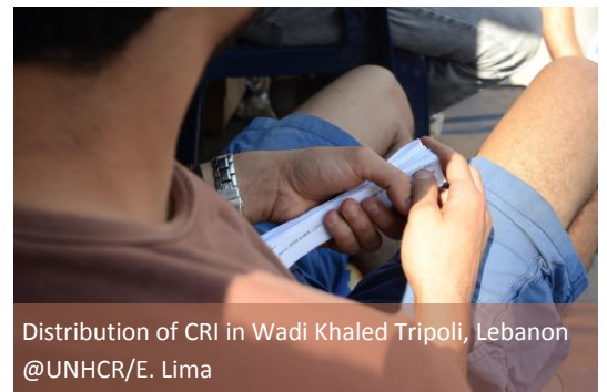
Distribution of CRI in Wadi Khaled Tripoli, Lebanon

Danish Refugee Council (DRC); World Vision (WV); Premier Urgence – Aide Medical International (PU-AMI); Save the Children; Makhzoumi Foundation; Agency for Technical Cooperation and Development (ACTED); Caritas, Social, Humanitarian, Economical Intervention for Local Development (SHEILD); Solidar Suisse; CISP; Concern, Medair, World Vision International and TdH – Italy.