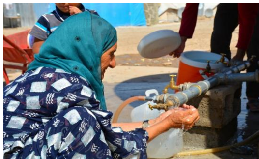
Iraq, KRI

In Iraq, as WASH interventions are moving to longer term and more sustainable water and sanitation solutions, partners are working to foster community structures to assume a higher level of ownership and responsibility. In Domiz and Qushtapa camps, residents are actively participating in WASH committee meetings. Camp feedback forums have been established to ensure the ideas and opinions are being voiced, and there is particular attention to ensuring women's participation and membership in the WASH committees. 25 training sessions of community mobilizers have been completed in three camps.