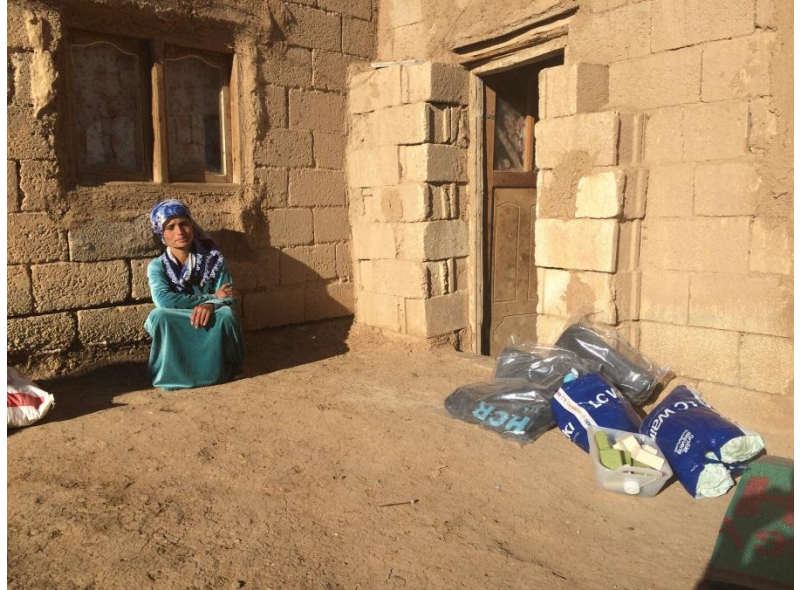
Syrian refugee family at Yenyapan Village

The AFAD Coordinator informed UNHCR that the Sub Governorate, the Şanlıurfa Metropolitan Municipality and TRC provide hot meals at the two AFAD temporary accommodation centers, the Bulgur Factory, the Wheat Market, the Onbirmisan District, the Culture Centre and Wedding Hall. On 14 October 63,000 hot meals had been offered to 21,000 Syrian refugees.