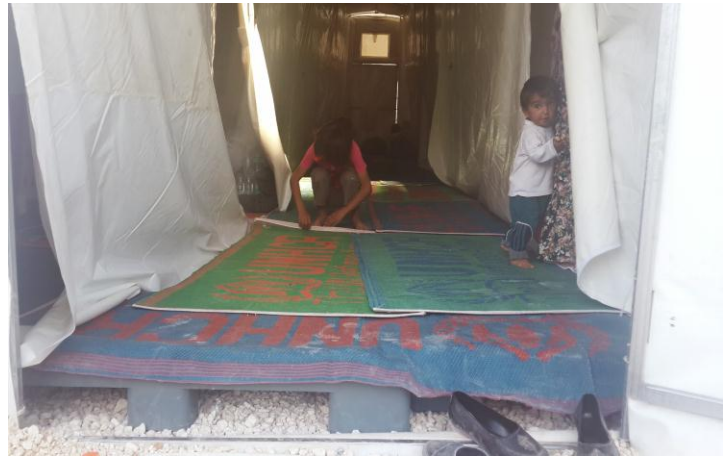
Syrian children in a shelter at Onbir Nisan.

AFAD officials reported that all Syrians have been evacuated from Suleyman Shah, and are now accommodated in the newly established 20 rub hall tents next to the YIBO school and in the Suruc Sports Hall.