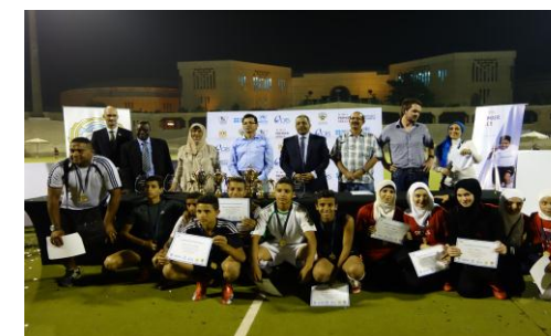
A Syrian, winning team poses in front of the officials, having received their Gold Medals.

The operational capacity of partners remains largely concentrated in Greater Cairo and to some extent Alexandria, affecting services to sexual gender based violence (SGBV) survivors in particular. CARE International plans to expand its services, including case management, to Alexandria after June 2014. Damietta, where the third largest concentration of Syrian refugees, remains without similar services. Challenges remain in identifying legal aid partners with sufficient coverage of major and smaller urban centers around the country.