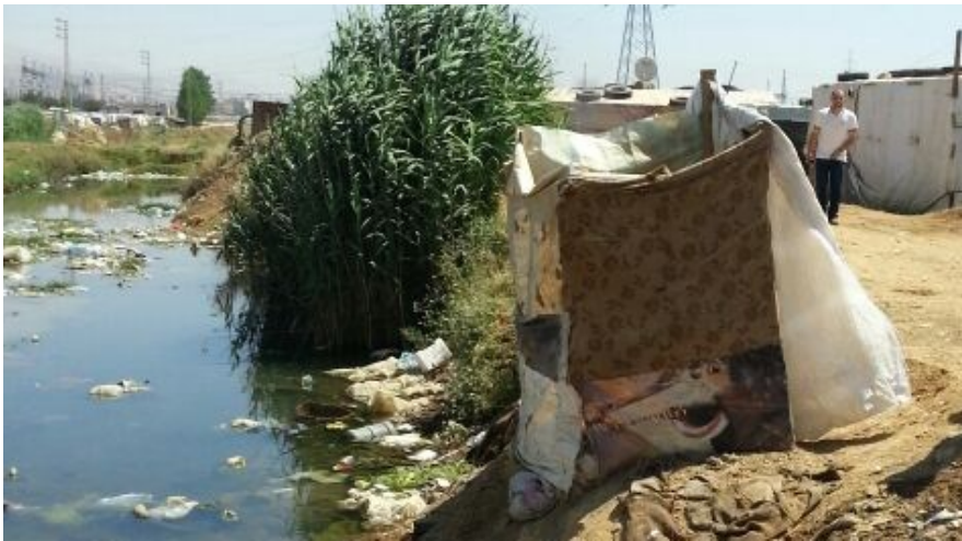
Sanitation facilities in some informal settlements are still below standards

NORTH: In the North, CISP has contributed 1.8 kms of completed network to a water supply project, the purchase of equipment for pumping station done and the delivery of a solid waste truck to Ardeh municipality, which benefited 497 Syrians and 3160 host community members.