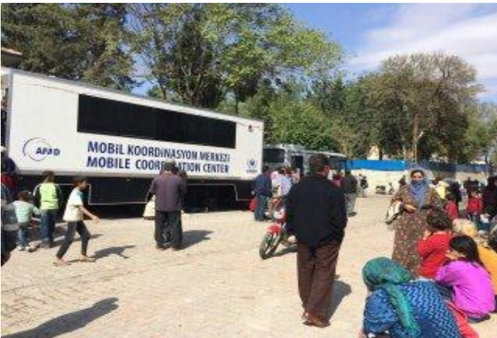
Mobile registration center in Suruc Town