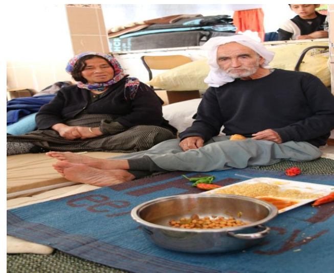
Daily meals provided for Syrians - Suruc/Sanlıurfa WFP,2014

IOM is supporting a soup kitchen run by the municipality in Gaziantep. On 9 October, IOM conducted a monitoring mission, meeting with the distributors employed by the Governorate, as well as beneficiaries who were waiting to receive assistance. The food kitchen supports 737 Syrian households (around 4,000 persons) living in urban areas in Gaziantep with one meal per day.