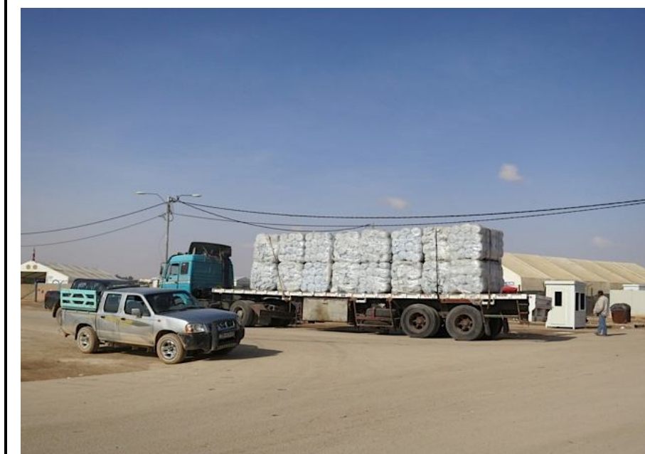
Blankets for winterization.