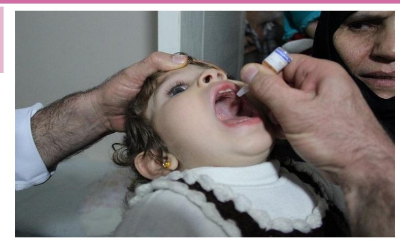
Polio immunization campaign in Istanbul

During November, distribution of high-energy biscuits provided by UNICEF continued in the following provinces: Osmaniye, Sanliurfa, Mardin, Malatya, Kilis, Kahramanmaras, Hatay, Gaziantep, Batman, Adiyaman, Adana, Istanbul and Gaziantep.