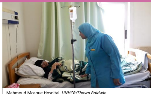
Mahmoud Mosque Hospital