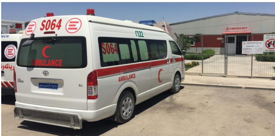
Arbat refugee camp PHC, Sulaymaniyah