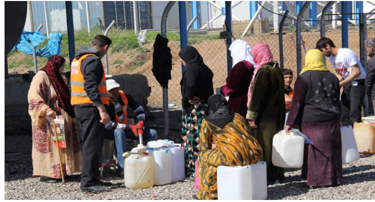
Extra kerosene distribution for vulnerable families in Darashakran refugee camp, Erbil. March 2016