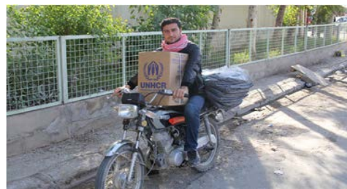
Distribution of Winterization and NFI's items in Iraq

In Egypt, a total of 30,710 vulnerable Syrian refugees were assisted through the provision of monthly cash grants.