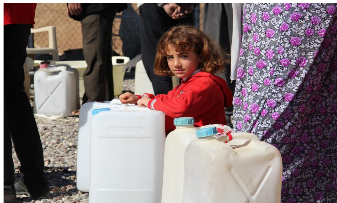
Small refugee waiting for kerosene distribution in Darashakran refugee camp, Erbil. March 2016

DRC implemented a programme of post distribution monitoring in Darashakran using an ODK tool.