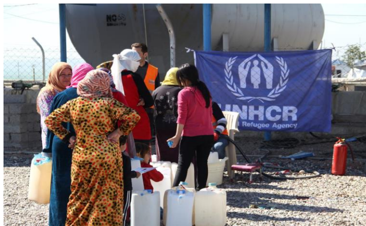
Extra kerosene distribution for vulnerable families in Darashakran refugee camp, Erbil, March 2016

Duhok: Reports an on-going requirement for fire extinguishers in all refugee camps as well as a fire truck for Domiz2. Hygiene kits in all camps 216 trash bins in Domiz2 and construction of shading at distribution points for none camp refugees.