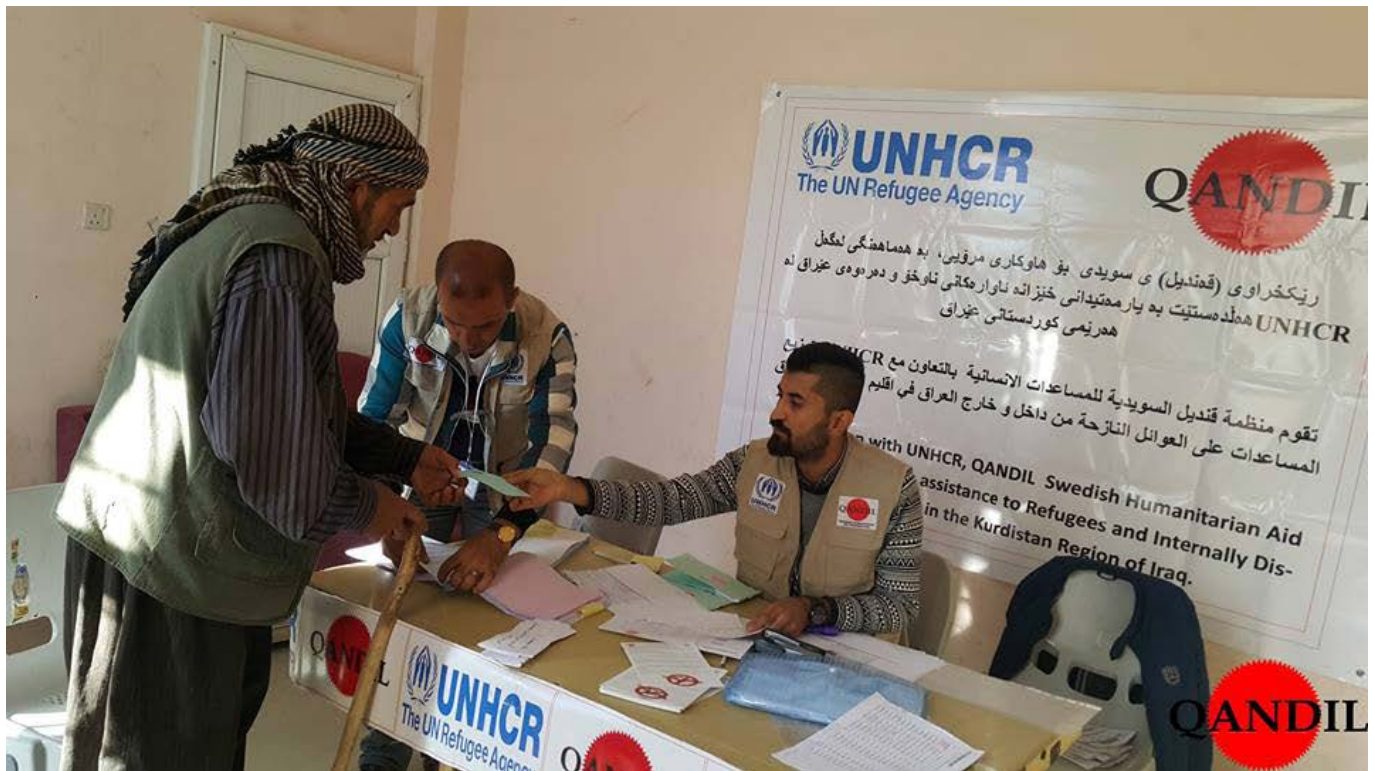
Cheque distribution, Chamchamal, Sulaymaniyah/ QANDIL

** The geographical distribution of Syrian refugees as 97% residing in Kurdistan region of Iraq and 3% in Center & South governorates.