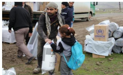
Winter distribution for out of camp refugees in Sulaymaniyah governorate.

Weather in the Middle East includes low winter temperatures, near or below freezing (especially at higher elevations), and heat during the summer often reaching in excess of 40 degrees Celsius. These extremes require warm clothes, energy for heating, and reinforced shelters during the winter, while in summer refugees need basic materials to create shade and protection from disease vectors, especially for children and the elderly.