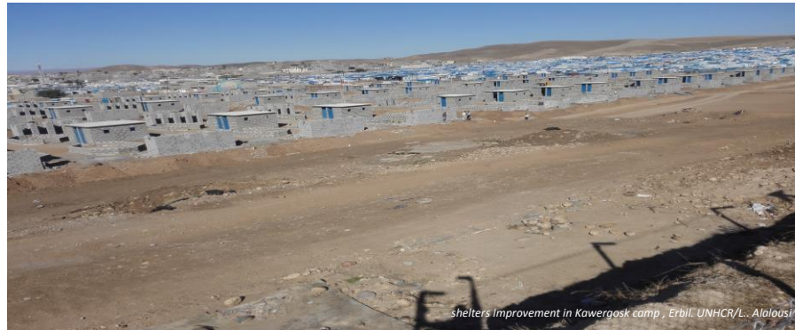
Shelters Improvement in Kawergosk camp, Erbil.

Akre: This is an old exist building. There are 283 families living in Akre and there is need to repair roof and other parts of the building. THW has completed electrical repair, minor rehabilitation for doors and windows and construction of additional 300m 2 of partition walls.