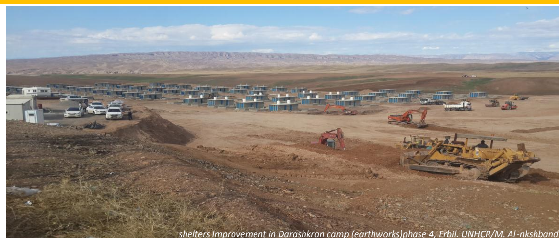
shelters Improvement in Darashakran camp (earthworks)phase 4, Erbil.

Sulaymaniyah: Qandil renovated 50 houses including electrical, plumbing and WASH works. These houses were selected according to UNHCR vulnerability criteria. Qandil will hand over the project in November 2015.