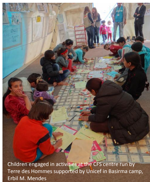
Children engaged in activities at the CFS centre run by Terre des Hommes supported by Unicef in Basirma camp, Erbil

Sulaymaniyah Governorate: 48 student kit boxes (containing 20 students kits per box) were distributed to Amuda school in Arbat refugee camp, reaching 950 beneficiaries. Also in Arbat camp, 480 desks were delivered to the new prefab in the Arbat school. Additionally, 7,500 child oriented pamphlets and posters on Cholera awareness were distributed to refugee schools both in camps and outside the camps in Sulaymaniyah.