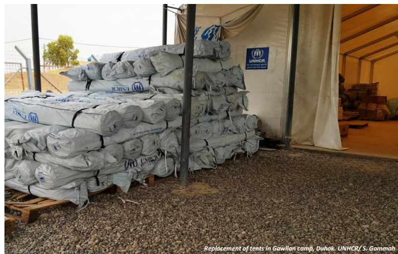
Replacement of tents in Gawilan camp, Duhok.

11,850 liters of kerosene was distributed by UNHCR through ISHO for 182 families. 14 CRI Kits to the newly arrived families were distributed to those entered the camp in September 2015.