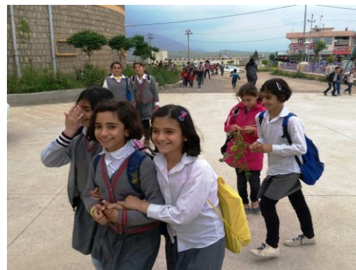
Children return back from school in Akre camp.

In Erbil Governorate: All schools in the 4 Refugee Camps in Erbil are open and teaching and learning activities commenced. A total of 312 Arabic student kits (Darashakran 101, Kawergosk 96. Basirma 42 and Qushtapa 73) were distributed to all schools benefitting 6,246 students (Darashakran 2,022, Kawergosk 1,927, Basirma 847 and Qushtapa 1,450). Education supplies were also distributed to non-camp locations in Kasnazan and Shawez. An education sector partner also supported youth committee activities in Qushtapa and Kawergosk camps, reaching 14 members (7 females). Non formal education activities reaching 660 children (male: 305, female: 355) and Early childhood care and development activities reaching 476 children (male: 249, female: 227) are also on-going in the same camps. In Daratu, one school consisting 8 classrooms for non-formal education and a playground for play and recreation activities has been completed and now in operation.