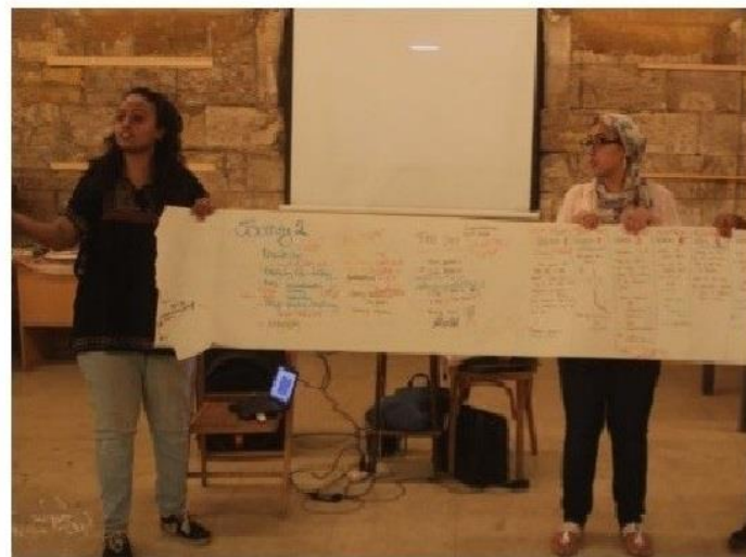
Partners of Athar Lina - Fos7a project interacting together in the brainstorming meeting and discussing the cultural activities of the project.