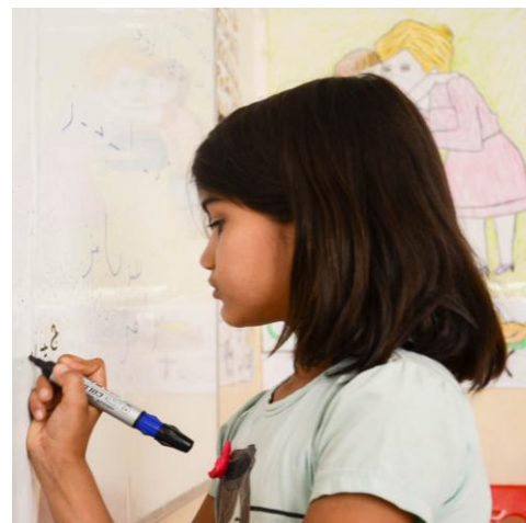
Erbil, KRI-I

In Sulaymaniyah the construction of two prefab caravan schools has been completed in Qirga and Chiwarhira areas to be handed over to the Directorate of Education in preparation for the start of the new school year. A new school in Arbat refugee camp is also near completion and will provide access to 1,000 refugee children. Repairs are on-going in Afrin refugee school in Bainjan for the 150 refugee students attending that school. Amouda refugee camp school in Arbat refugee camp school also underwent repairs. 20 students in Kamil Baseer and Kardokh schools were participating in computer classes. Sector partners are finalizing preparations for the Back to School Campaign, which will officially start in August in the KRI. The new school year is scheduled to commence on September 10. The MoE officially approved the proposal to allow urban Syrian Refugee Students in lower elementary classes to register in Kurdish schools 1 st -3 rd grade. This will ease the demand on the Arabic schools in KRI. Furthermore, a number of Quick Impact Projects will be implemented per governorate to reinforce local school capacity.