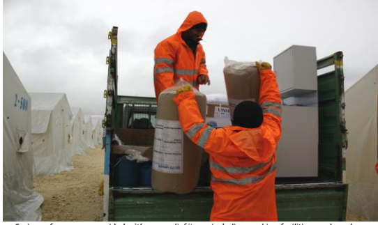
Syrian refugees are provided with core-relief items including cooking facilities, cupboards, blankets, heaters.

IMC has already forwarded the payment to the contracted voucher company, following the signature of the contract and have processed the purchase orders for the issuance of the vouchers. IMC expects to receive the vouchers in the following weeks, and the distribution is expected to start immediately upon receipt of the vocuher cards.