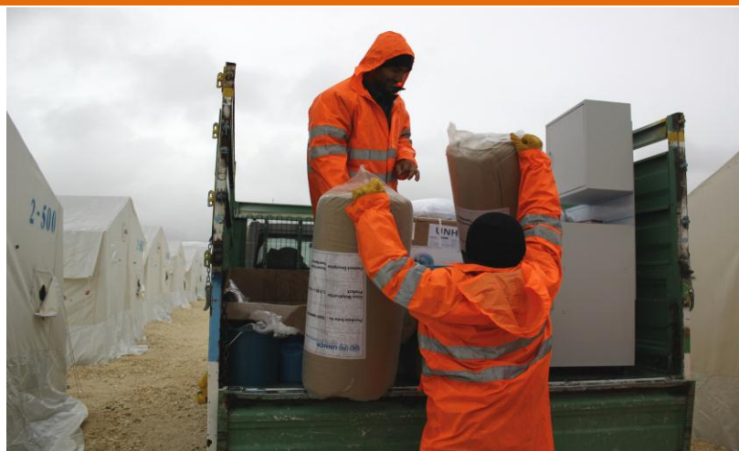
Syrian refugees are provided with core-relief items including cooking facilities, cupboards, blankets, heaters.

The current system IMC has in place for targeting includes mobile teams visiting, on a daily basis, the Social Solidarity Foundations (SSFs) and Mukhtars to receive a list of vulnerable Syrian refugees. These vulnerable individuals are then visited for interview and assessment by IMC social workers, and the vulnerability check-list is completed for verification. Only those families assessed as vulnerable are entitled to the voucher assistance to support their basic needs.