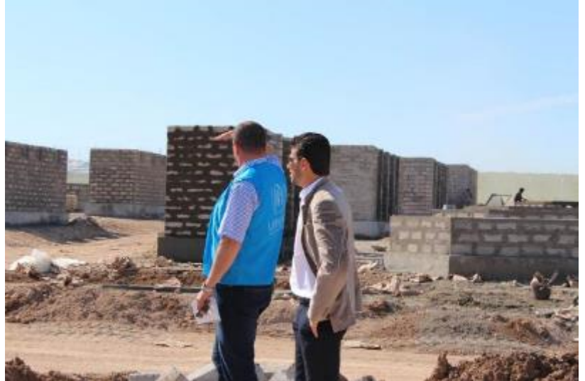
The housing project in Domiz I refugee camp will benefit nearly 500 families that are currently being accommodated in irregular shelters