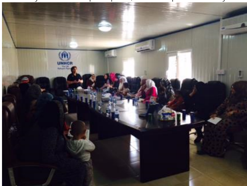
A Focus Group Discussion session for refugee women and representatives of the Women's Committee in Darashakran camp, Erbil Governorate.