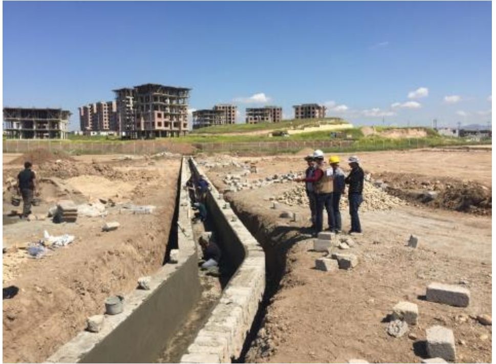
The construction of a new extensions in Domiz 1 and 2 camps, Dohuk Governorate.