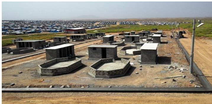
Gawilan Refugee Camp, Duhok.