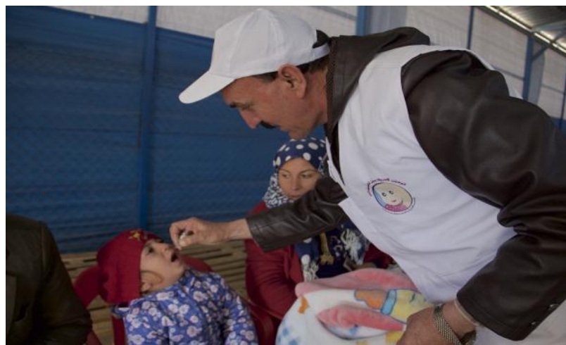
Vaccination of new arrivals at Ibrahim Khalil Border point, Duhok.