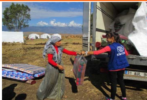
Turkey, Provision of NFIs in Adiyaman - IOM/2014