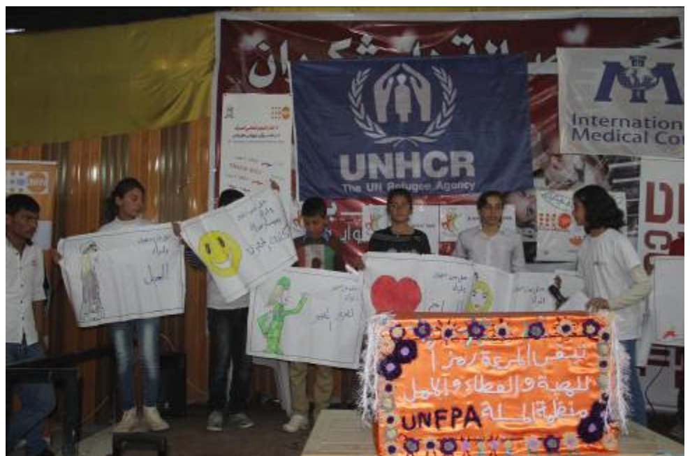
Youth presenting their drawings at celebrations of the International Women's Day, Darashakran camp, Erbil Governorate