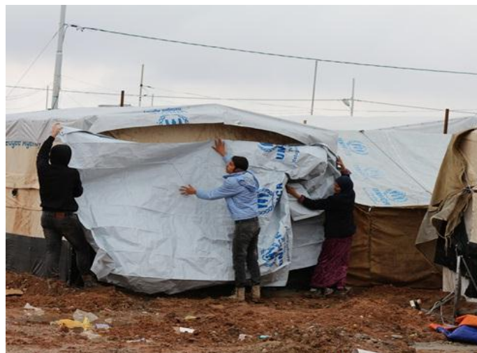
Domiz Refugee Camp, Duhok.