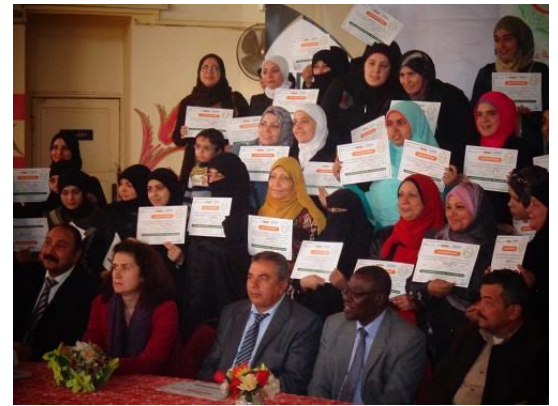
Syrian and Egyptian women receiving their Certificates of Completion of their courses in cooking and handcrafts in New Damietta under the L'omet Aaish livelihood project.