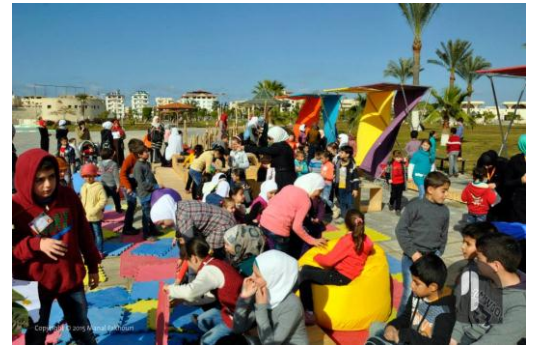
Syrian and Egyptian children at the opening of Hoosh Yegam'ana in New Damietta central park