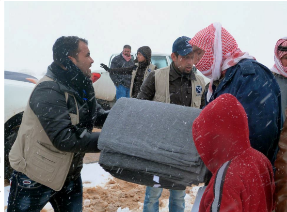
ACTED staff providing blankets in Mafraq

The inter-agency responses to the snowstorms Jana and Huda are part of a broader winterization mechanism that has been in place since October 2014.