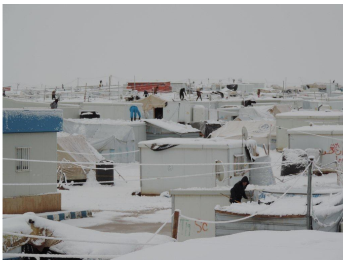
Refugees clearing shelters in Zaatar