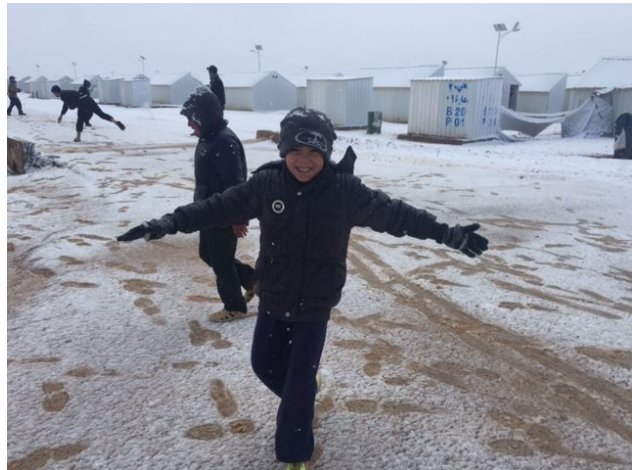
Refugees were able to continue their daily activities in Azraq, and even enjoy the snow