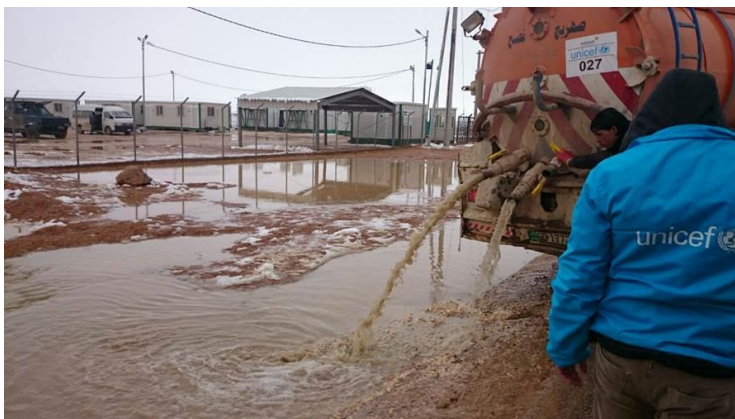
Storm water release, Zaatar Camp