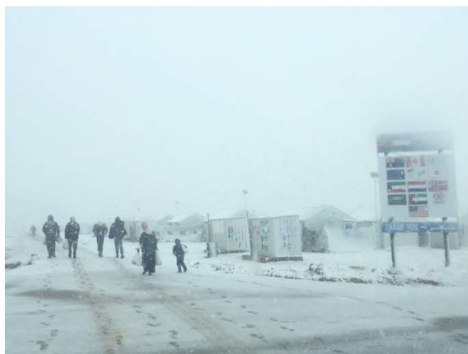
Jana Snow Storm hits Azraq Camp