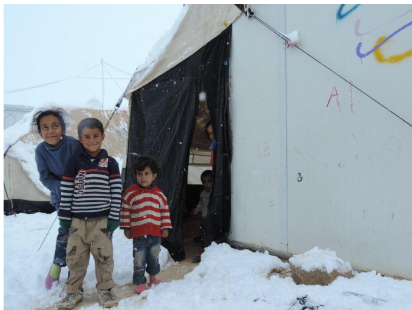
Refugee children playing outside their shelter; Zaatari