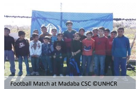
Football Match at Madaba CSC