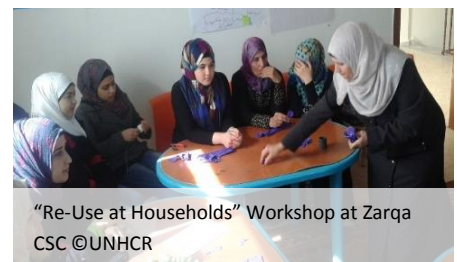
"Re-Use at Households" Workshop at Zarqa CSC