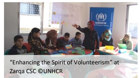
"Enhancing the Spirit of Volunteerism" at Zarqa CSC