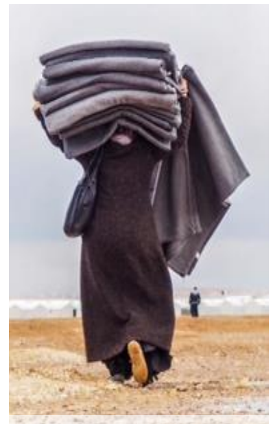
Elderly woman taking blankets back to her shelter in Azraq refugee camp.

Three airlifts from the United Arab Emirates (UAE) each carrying close to 30,000 blankets donated by the Ruler of Dubai landed in Marka airport, Amman, on Wednesday 7 and Thursday 8 January. Some trucks left directly from the airport for distributions that began immediately. In addition, UNHCR mobilized 20,000 blankets for non-Syrian refugees and vulnerable Jordanians.