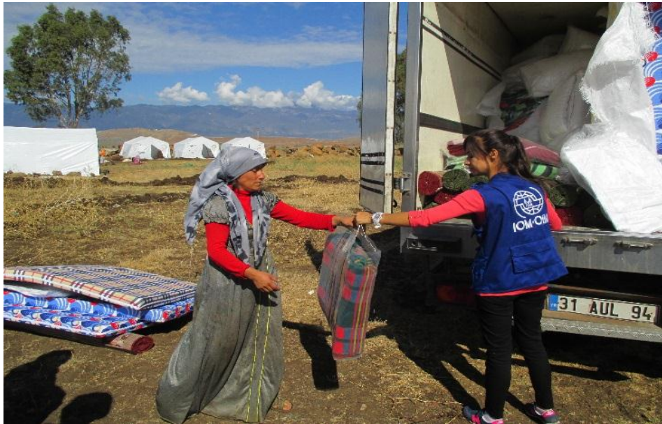
Provision of NFIs in Adiyaman

Through its implementing partner Support to Life (STL), IOM continued to support 524 households (3,067 individuals) living in Kirikhan / Hatay through the provision of vouchers. Since the beginning of the year, 17,500 Syrian refugees have been supported in Hatay through IOM's voucher-programme.