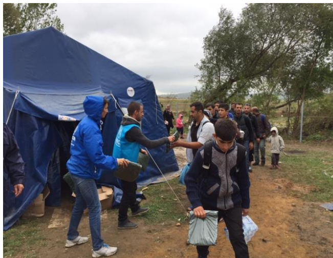
UNHCR staff distributing raincoats to refugees arriving from FYR Macedonia at Miratovac RAP