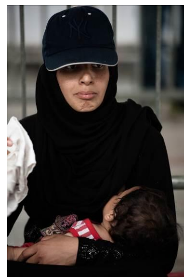
Syrian family awaiting registration outside the One Stop Centre in Preševo, South Serbia

Intention to apply for asylum (Source: Ministry of Interior)