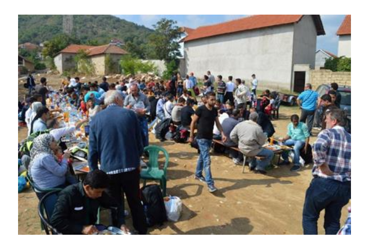
Local community organized celebration of Bajram for the refugees in Miratovac