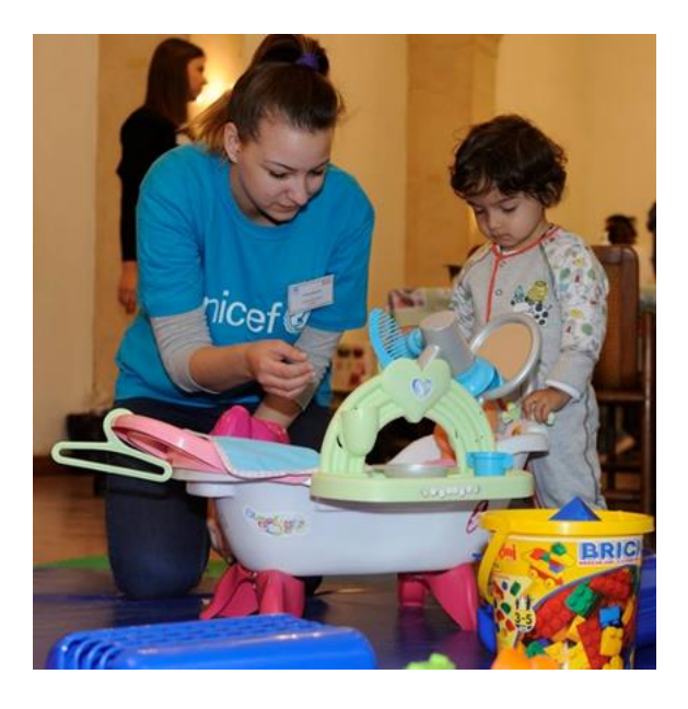
Child-Friendly Space and Breastfeeding Room for Children and Mothers on the Move opened in Belgrade