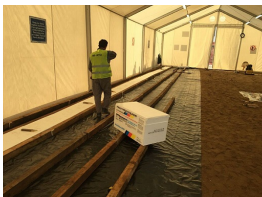
Preševo - Winterization of rub halls in progress