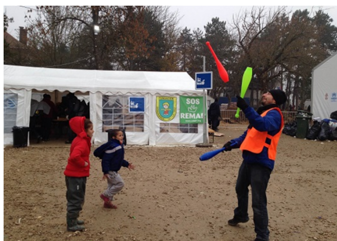
Preševo - REMAR staff entertaining the youngest, Photo©UNHCR