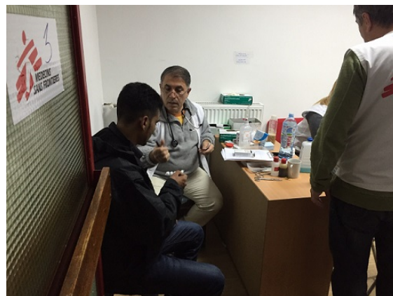
Adaševci - MSF team providing medical assistance to arriving refugees, Photo©UNHCR