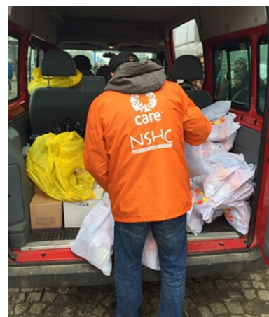
Šid - NSHC, funded by Care and Terre des Hommes, distributing food and winter jackets for women and children, Photo©UNHCR