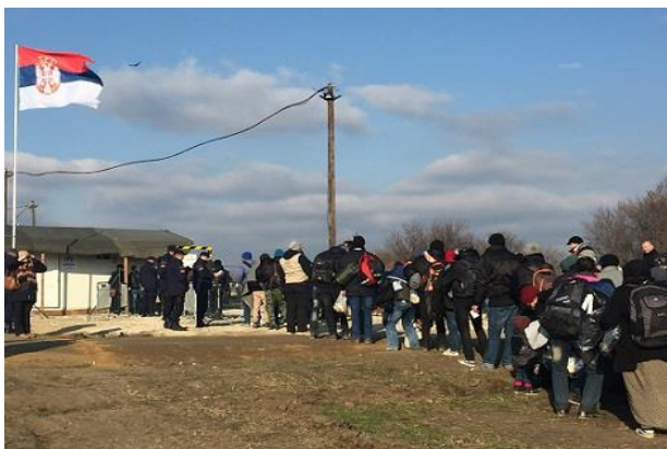
New RAP entrance with UNHCR funded equipment for security checks, Miratovac (Serbia), 17 December 2015

Police, IOM, Philanthropy, Remar, Medical Centre, UNHCR, MSF and UNICEF are establishing their 24/7 presence at the new RAP. Humedica and MSF are present in the Miratovac village from 07:00 to 23:00 hrs.