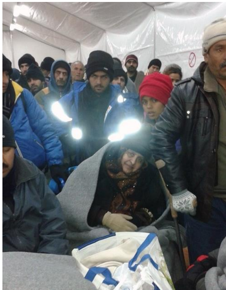
Asylum seekers awaiting registration Preševo (Serbia), ©UNHCR, 20 January 2016

1,064 refugees and migrants were assisted at the Miratovac Refugee Aid Point (RAP) upon arrival from fYRo Macedonia.