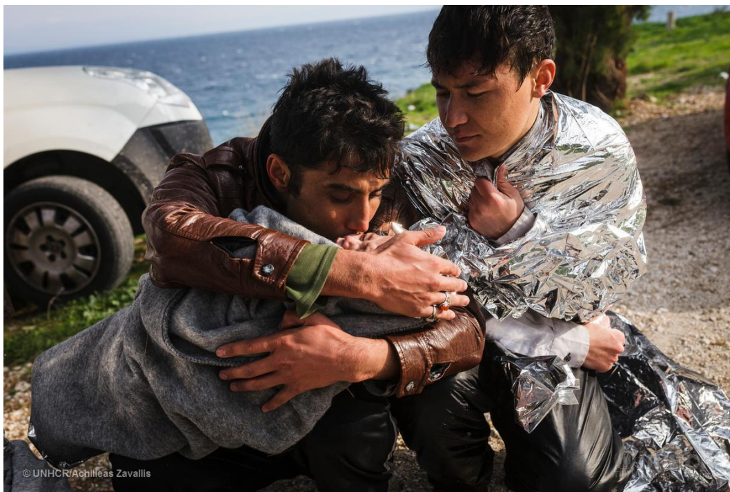
A young man from Afghanistan tries to keep his six month old baby warm shortly after reaching the shores of Lesbos, Greece.

As of 27 January 2016, 257 individuals were relocated out of Italy and 157 out of Greece, totaling 414 persons relocated so far to 11 Member States. In terms of places pledged, 16 Member States and Lichtenstein have offered relocation places.