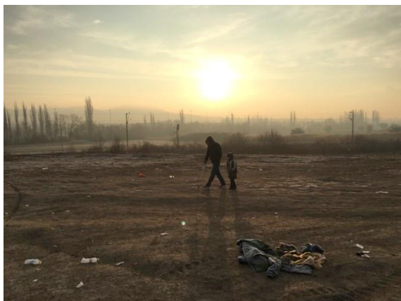
New arrivals at the border between fYRo Macedonia and Serbia, Miratovac (Serbia), ©UNHCR, 9 February 2016

2,337 refugees and migrants were assisted at the Miratovac Refugee Aid Point (RAP) upon arrival from fYRo Macedonia.