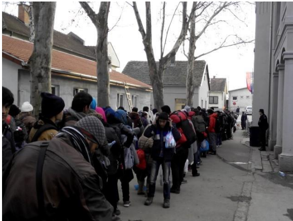
Long queue for boarding the train to Croatia, Šid (Serbia), ©UNHCR, 8 February 2016

61 were denied boarding by Croatian authorities and placed in the Sid RAP.