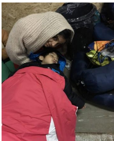
Family resting at REMAR tent, Preševo (Serbia), ©UNHCR, 7 February 2016

7,206 (2,650 on 5/02; 1,849 on 6/02; 2,707 on 7/02) refugees and migrants were assisted at the Miratovac Refugee Aid Point (RAP) upon arrival from fYRo Macedonia.