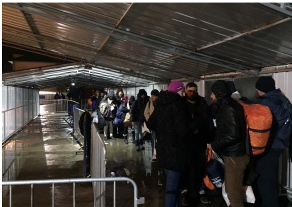
Asylum seekers boarding the train to Croatia early in the morning, Sid (Serbia), ©UNHCR, 4 February 2016

At Sid train station, UNHCR/HCIT distributed UNHCR blankets, 700 WFP HEB, 624 water bottles, 104 winter jackets, boots, and 35 UNHCR bags.